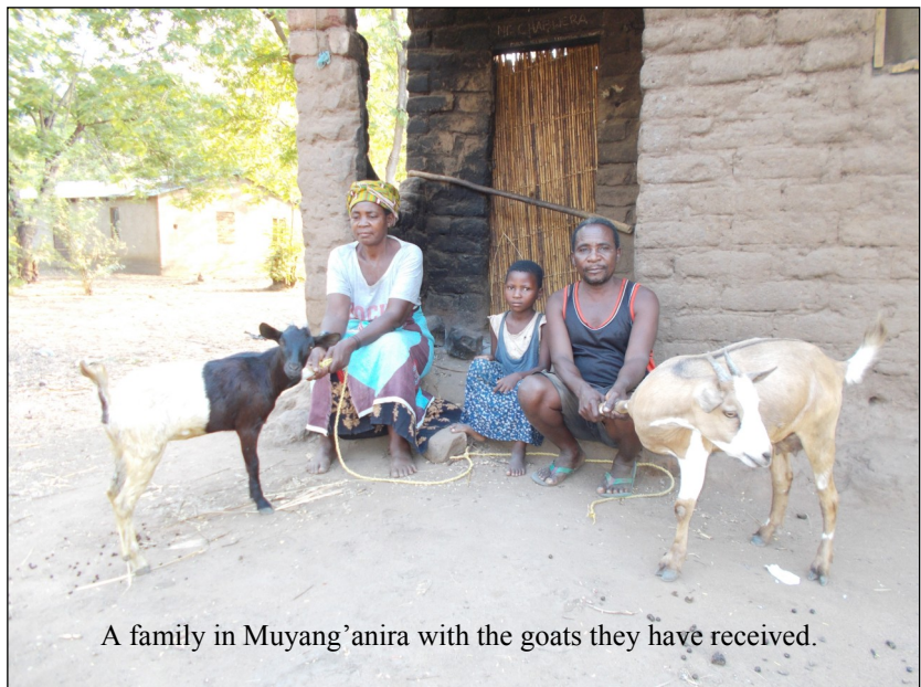
A family in Muyang'anira with the goats they have received.

This year 25 families in Muyang'anira village were given 2 goats each to help them over these difficult times. The distribution was organised and supervised by the local Veterinary Officer, who suggested that the scheme should incorporate a 'Pass On' principle, whereby one of the offspring of the goats is passed on to another family in the village. The families have been chosen by the village committee according to need.