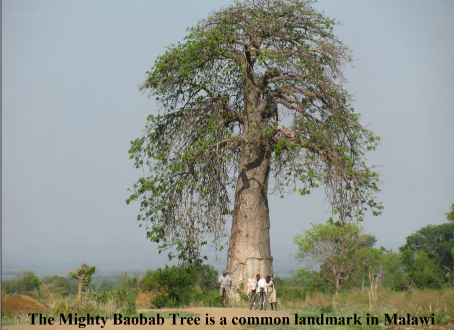
The Mighty Baobab Tree is a common landmark in Malawi